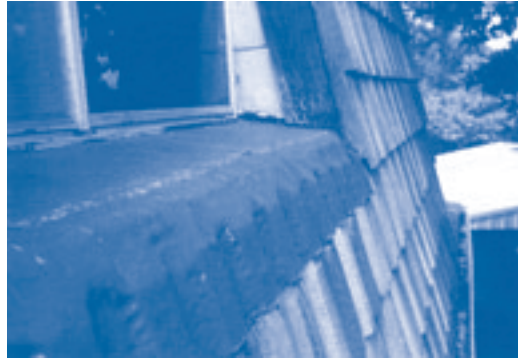
Weathered asbestos roofing