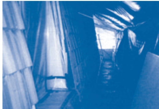
Commercial asbestos removal

The Ministry of Health strongly recommends that you use DOL (OSH) certified contractors to remove ACM, particularly if there is wire, cladding, paint or plastic covering the ACM, as the process or removal is likely to be difficult. Incorrect removal is likely to release asbestos fibres, which are a risk to health.